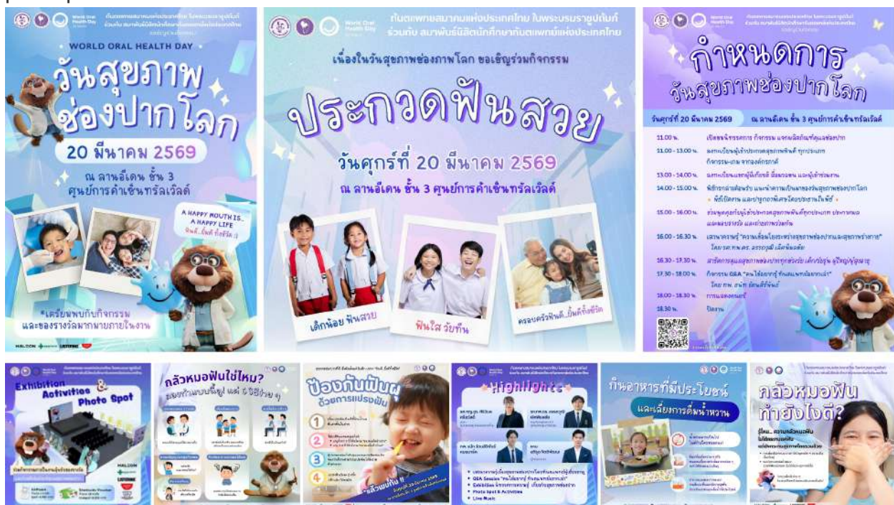
Campaign promotional materials, posters, and social media graphics for WOHD 2026 Thailand

Maintain and enrich the dedicated WOHD Thailand website (wohd2026.thaidental.or.th) as a central hub for campaign information and public participation.