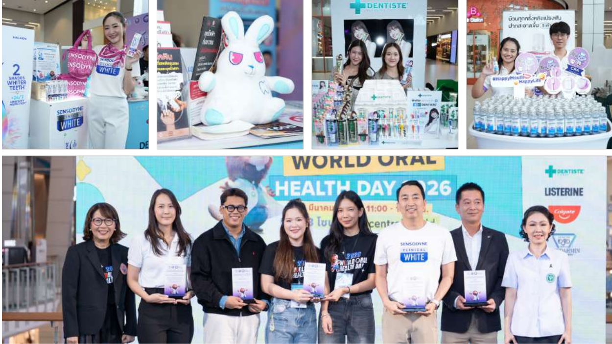
Photos of corporate partner booths and the Dentist Hero booth