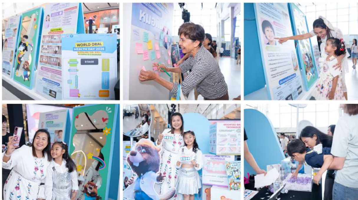
Four DSAT activity booths and the passport-stamp system

Life Long Oral Care: This station provided age-specific oral care knowledge and tips for each stage of life, offering practical advice that participants could apply in their daily routines.