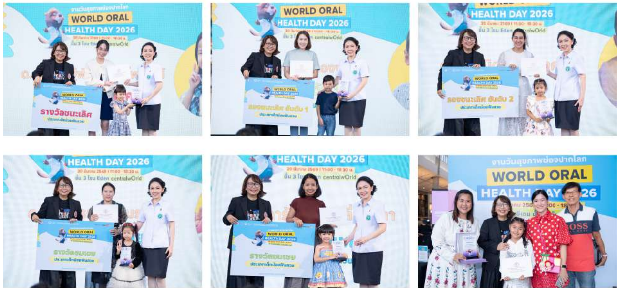
The dental health beauty contest winners and participants