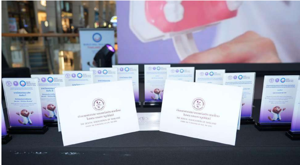
Trophies, and giveaways